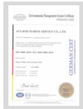
ISO14001 Environmental Management System Certification 韩国ISO14001环境管理体系认证