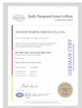
ISO9001 Quality Management System Certification 韩国ISO9001质量管理体系认证