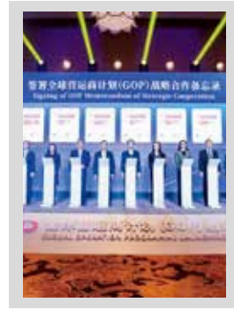
Signing of GOP (Global Operation Programme) Memorandum of Strategic Cooperation 作为首批企业签约“全球营运商计划”