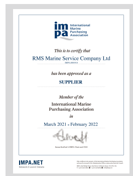
IMPA Membership IMPA 协会会员