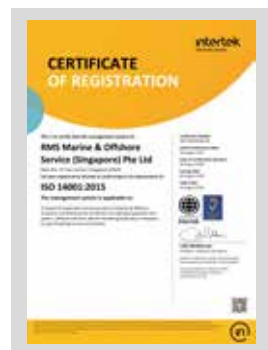
ISO14001 Environmental Management System Certification 新加坡ISO14001环境管理体系认证