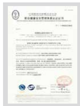
ISO45001 Occupational Health and Safety Management System Certification ISO14001职业健康安全管理体系认证