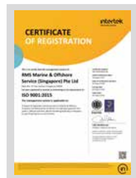
ISO9001 Quality Management System Certification 新加坡ISO9001质量管理体系认证