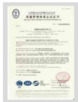
ISO9001 Quality Management System Certification ISO9001 质量管理体系认证

经过 28 年的稳健发展，润通已成为亚太区领先的一站式航运供应链服务和安全技术服务解决方案提供商。企业荣誉见证了润通在航运领域的卓越表现及良好的口碑。