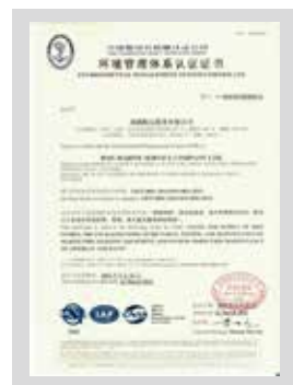
ISO14001 Environmental Management System Certification ISO14001 环境管理体系认证