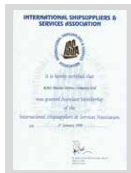
ISSA Membership ISSA 协会会员