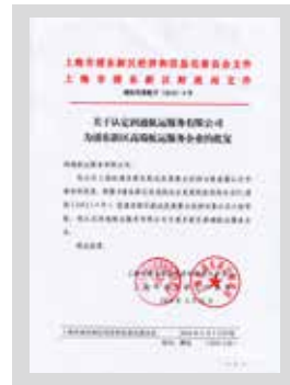
High-End Shipping Service Enterprise 高端航运服务企业