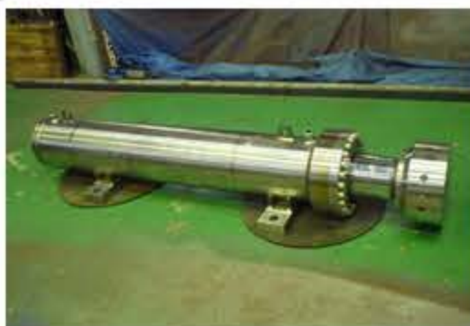
HYDRAULIC SYSTEM WATER DAM OPERATING SYSTEM