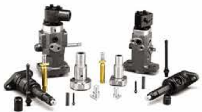
FUEL INJECTION EQUIPMENT