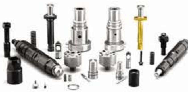
FUEL INJECTION EQUIPMENT