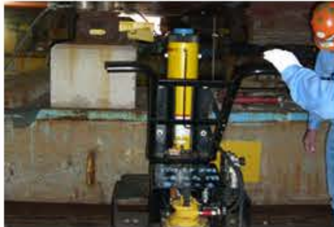
HYDRAULIC SYSTEM CART JACKEY FOR BLOCK LIFT