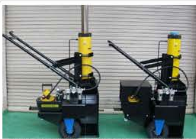
HYDRAULIC SYSTEM CART JACKEY FOR BLOCK LIFT