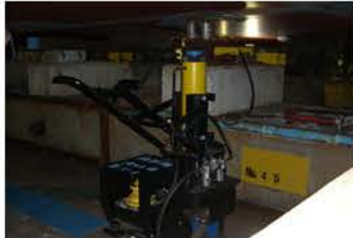
HYDRAULIC SYSTEM CART JACKEY FOR BLOCK LIFT