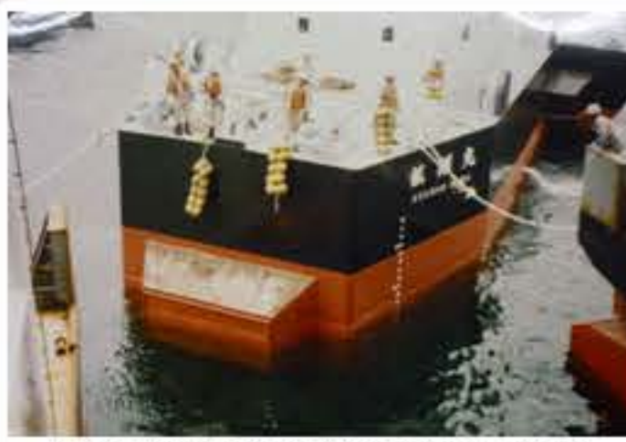
HYDRAULIC SYSTEM FAST JOINT P/B SYSTEM