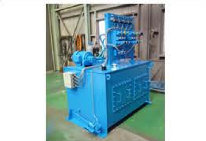
HYDRAULIC SYSTEM WATER DAM OPERATING SYSTEM