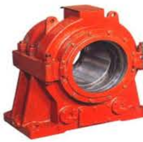
INTERMEDIATE SHAFT BEARING