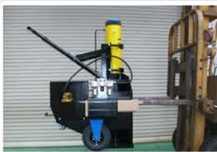
HYDRAULIC SYSTEM CART JACKEY FOR BLOCK LIFT